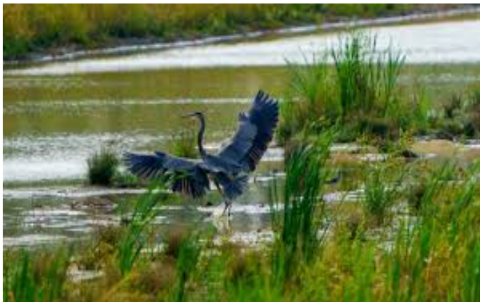
Great Blue Heron in a wetland environment. URL. https://www.camphall.com/news/camp-hall-successfully-completes-phase-1-of-its-wetland-restoration-project/ . camphall.com

As stewards of the land, family farmers are uniquely positioned to implement conservation practices that align with both their heritage and the future needs of our planet. By embracing these programs, they ensure that rural communities continue to thrive, local economies remain strong, and America's natural resources are protected for generations to come.