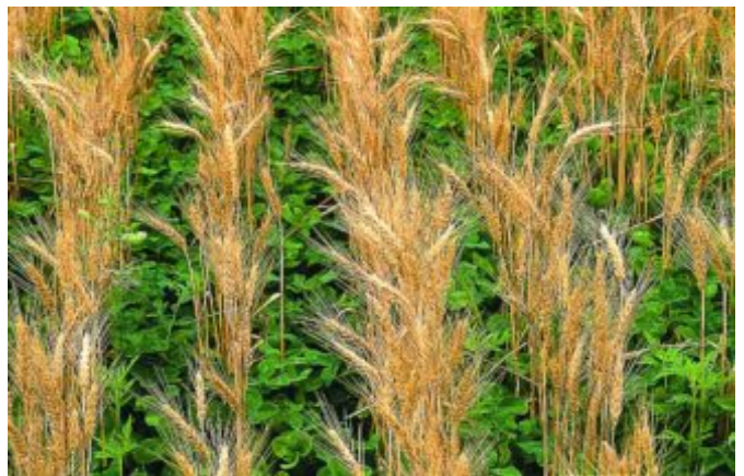
Wheat and clover used as cover crops "Cover Crops," URL. https://www.sare.org/resources/cover-crops/ . www.sare.org